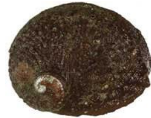
Above; Blacklip Abalone

All commercial and recreational fishers should ensure that they clean their fishing gear and equipment prior to changing fishing locations. This includes using detergent to wash down fishing vessels, equipment and dive gear.