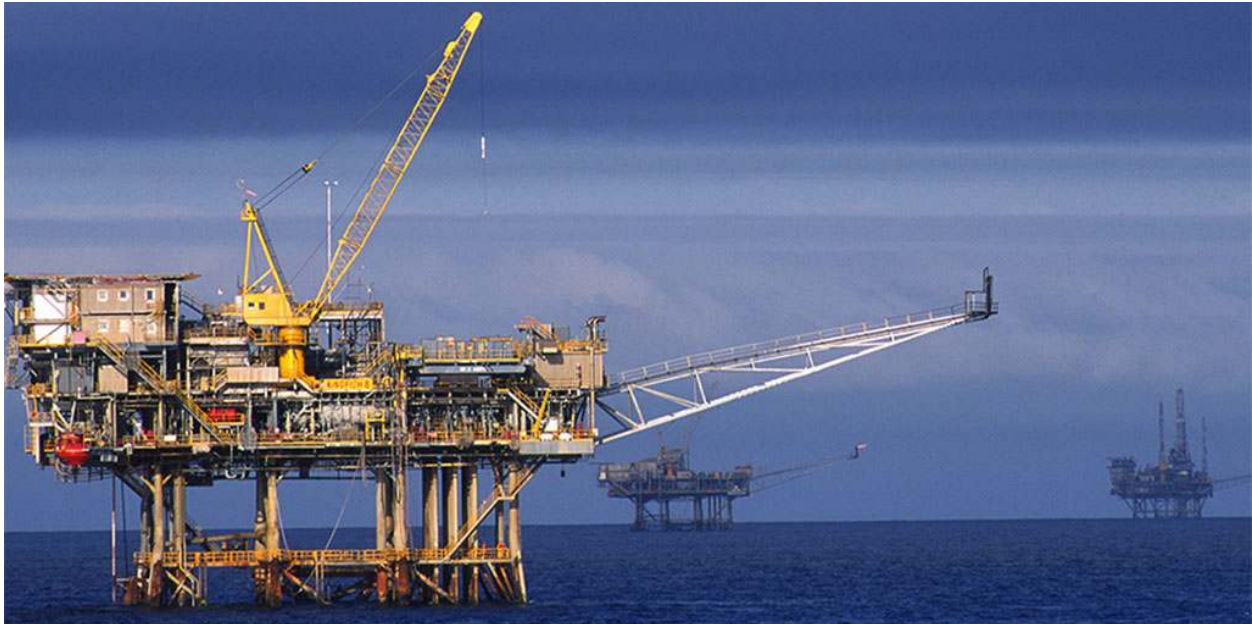
Bass Strait Platforms

Please note: Coordinates are listed Degrees Minutes Seconds.